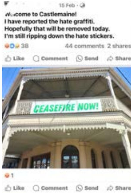
Seen in Castlemaine on my weekly removal of hate poster duty.

Defaming Palestinians and their allies such as being inherently antisemitic, a terrorist threat/sympathizer or opposed to democratic values.