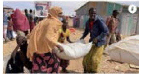
reuters.com Nearly 50 million facing hunger in West, Central Africa as conflict spreads