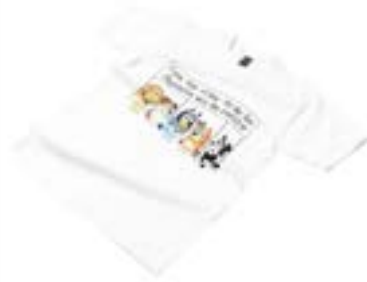
Freedom Fighter Bluey T-

The pro Palestinian protesters are doing everything they can to seed hate in our kids hearts. This time they are using the beloved kids character Bluey to promote their standard Israeli genocidal phrase. Don't think they have the rights to use Bluey this way.